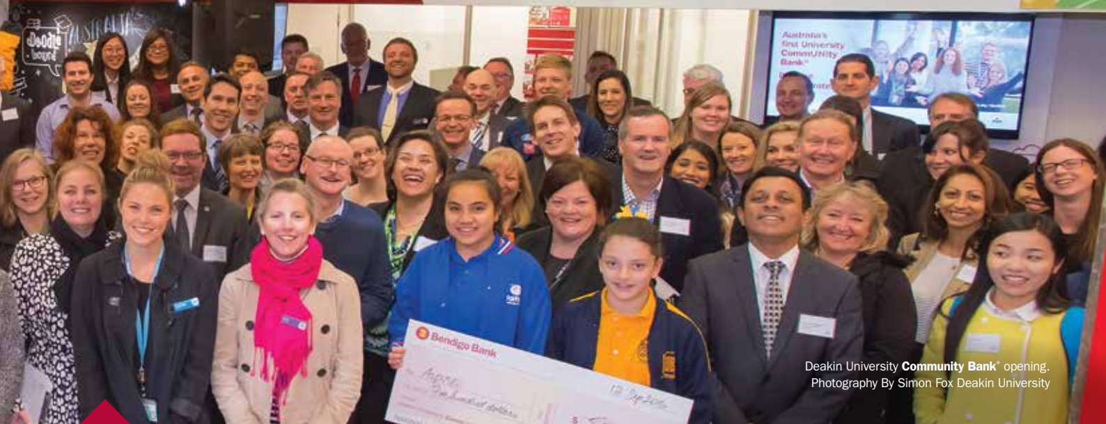
Deakin University Community Bank® opening.