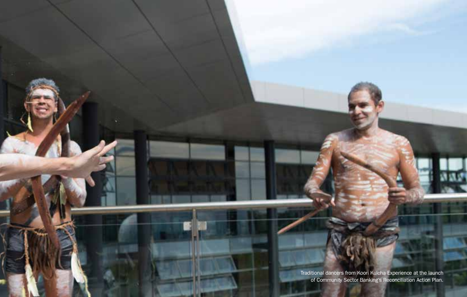
Traditional dancers from Koori Kulcha Experience at the launch of Community Sector Banking's Reconciliation Action Plan.