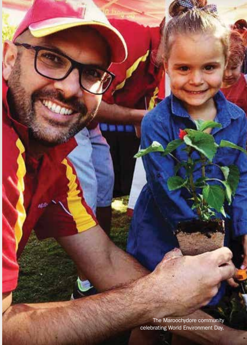
The Maroochydore community celebrating World Environment Day.