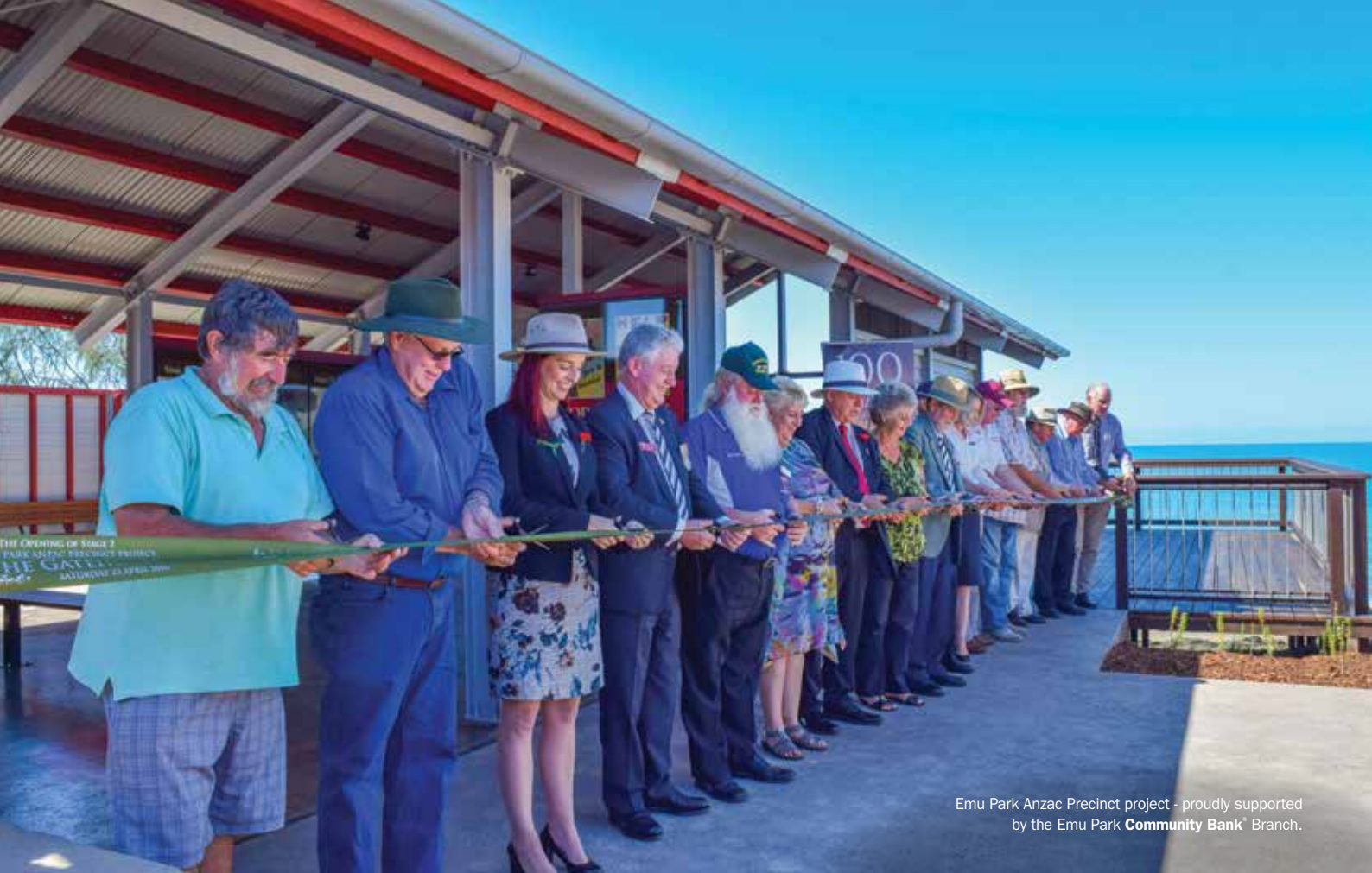
Emu Park Anzac Precinct project - proudly supported by the Emu Park Community Bank ® Branch.