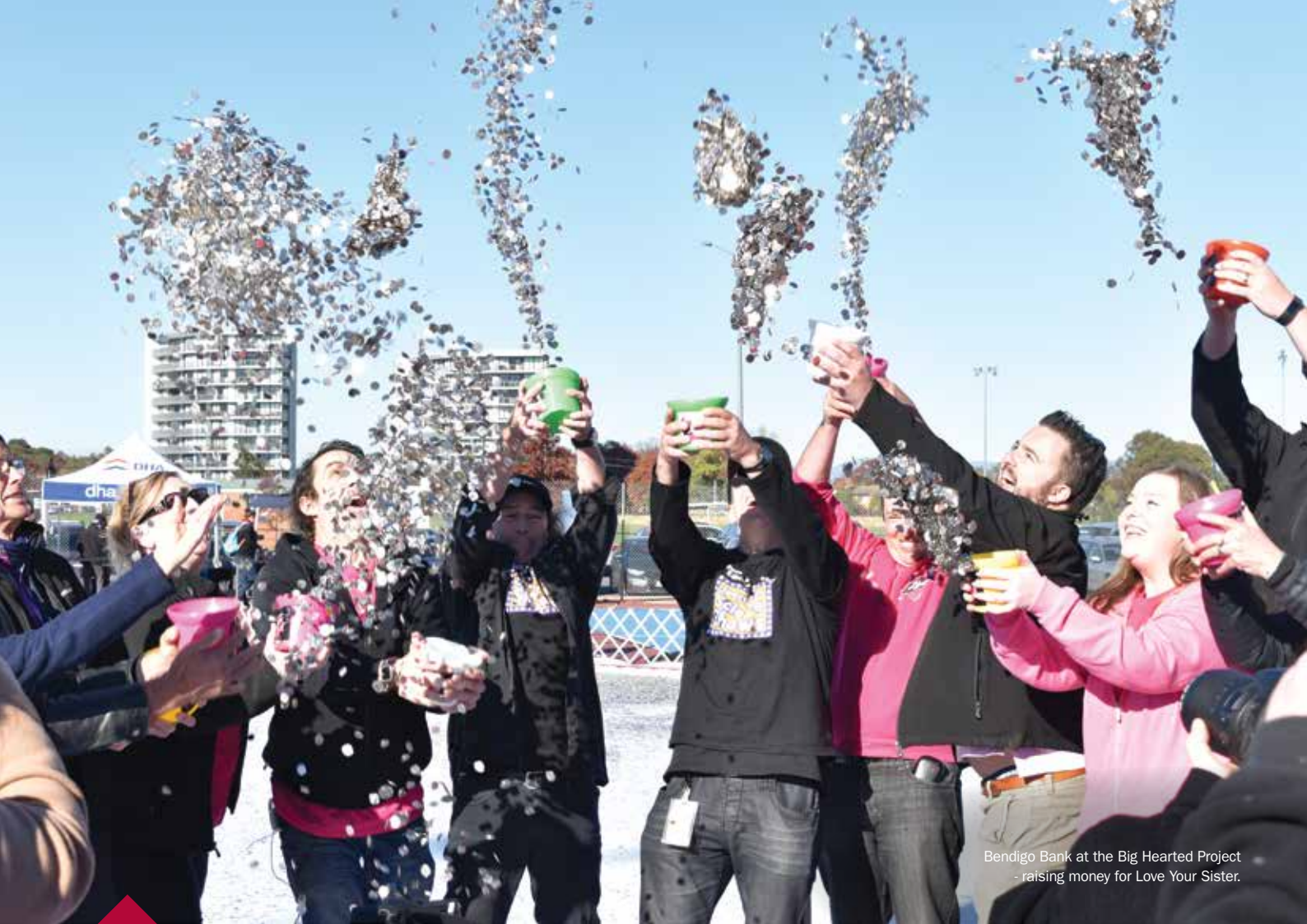
Bendigo Bank at the Big Hearted Project - raising money for Love Your Sister.