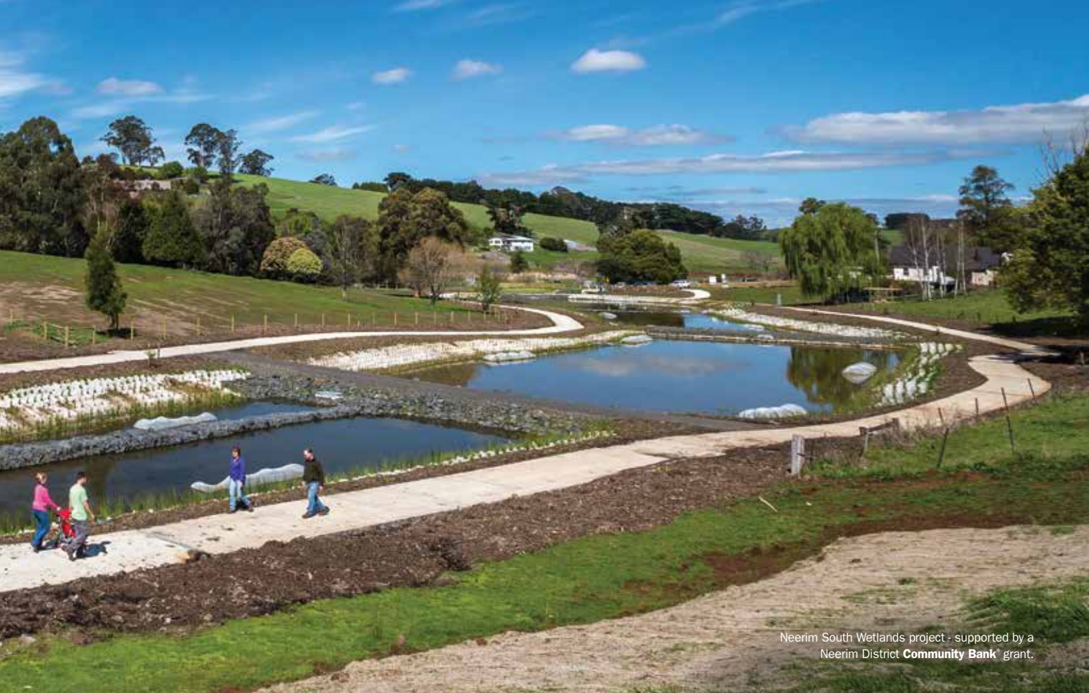
Neerim South Wetlands project - supported by a Neerim District Community Bank grant.