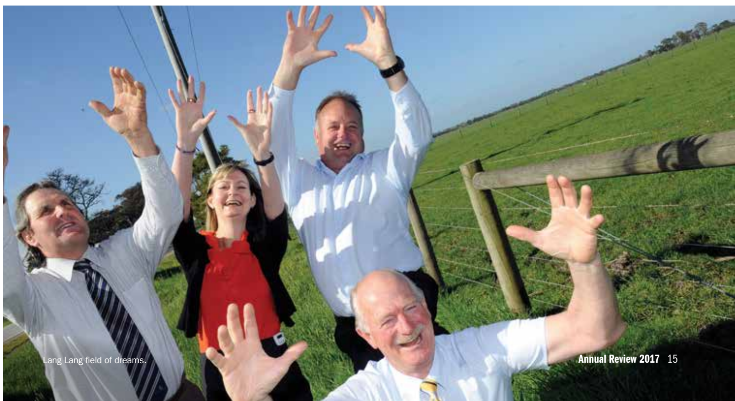
Lang Lang field of dreams.

Another example is the 'Field of Dreams' project, a new sporting stadium for the Lang Lang community in Victoria which has been in the making for more than 10 years. The Lang Lang Community Bank ® Branch committed the initial $3.3 million to the project and, importantly, lobbied government and the private sector to provide the additional $15 million required to build the sporting ground in time for the 2018/2019 cricket season.