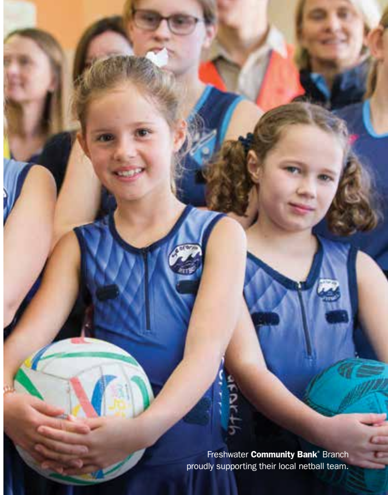
Freshwater Community Bank Branch proudly supporting their local netball team.